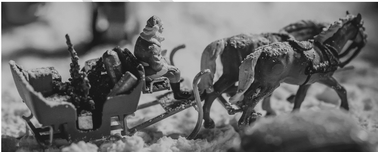
Figure 1: Conceptual design of sled

Lorem ipsum dolor sit amet, consectetur adipiscing elit, sed do eiusmod tempor incididunt ut labore et dolore magna aliqua. Ut enim ad minim veniam, quis nostrud exercitation ullamco laboris nisi ut aliquip ex ea commodo consequat. Duis aute irure dolor in reprehenderit in voluptate velit esse cillum dolore eu fugiat nulla pariatur. Excepteur sint occaecat cupidatat non proident, sunt in culpa qui officia deserunt mollit anim id est laborum.